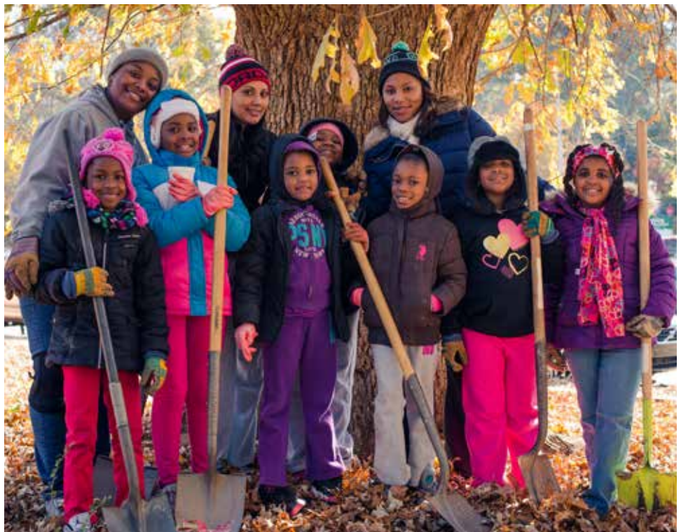
Residents of Columbia Elementary communities show up in force for a Fall tree planting with DSNI and Trees Atlanta.