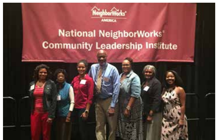
ANDP's Neighbors Together participants attend the National NeighborWorks Community Leadership Institute in Houston, Texas in 2018.

Visit www.andpi.org/nt to learn more about the Neighbors Together program.