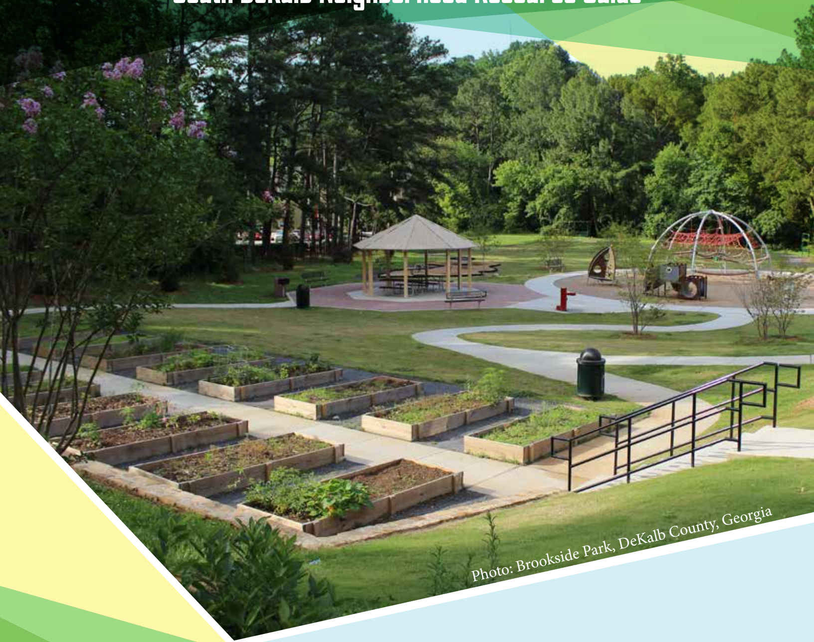
Photo: Brookside Park, DeKalb County, Georgia

Homebuyer, Homeowner, and Community Development Information for South DeKalb Residents, Neighborhoods, and Stakeholders.